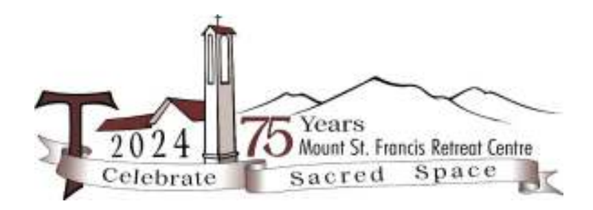
Mount St. Francis Retreat Centre is celebrating 75 Years August 10 and 11, 2024

Family Festival on Saturday. Anniversary Mass on Sunday. More details and to register: mountstfrancis.ca